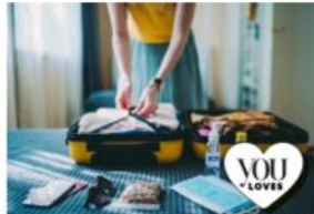
Suitcase packing tips: 10 packing hacks to make your holiday preparation easier