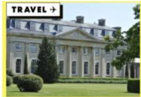
Hotel review: The Ickworth, Suffolk