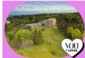
Hotel review: The Culloden Estate & Spa