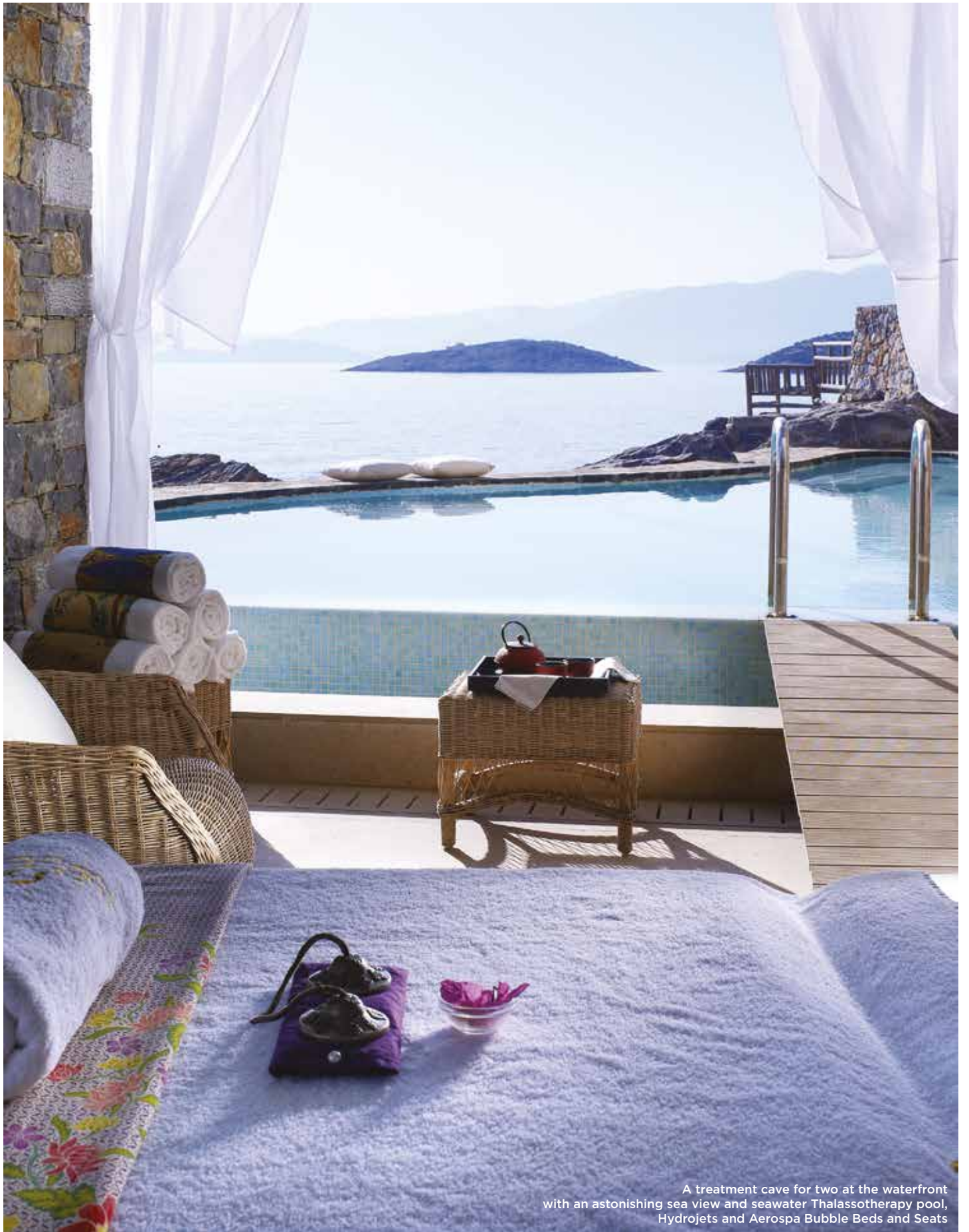
A treatment cave for two at the waterfront with an astonishing sea view and seawater Thalassotherapy pool, Hydrojets and Aerospa Bubble Beds and Seats